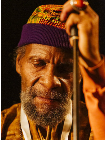
FB: @Abiodun Oyewole