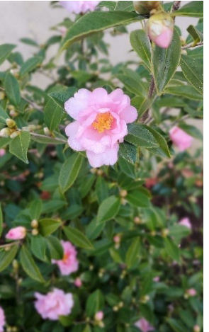
[ Camellias blooming in November, Camellia japonica 'Spring's Promise'; Camellia x 'Survivor'; Camellia spp ]

Ginkgo biloba , also known as the Maidenhair tree , is an ancient tree that still has much to offer today. The Ginkgo is considered a "living fossil" – leaf fossils of this remarkable tree have been found dating back to over 200 million years ago. Its unique, fan-shaped leaves turn from bright green to a stunning golden yellow color in the fall. As the leaves begin to fall, they create a beautiful golden carpet beneath the tree, as seen in this photo from November. This particular specimen can be found on the lawn behind the Museum Building. And no need to worry about the infamous stinky fruits produced by female Ginkgo trees – you'll only find male Ginkgo at GFS.