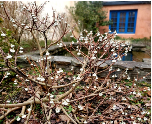
[ Edgeworthia chrysantha , with its bare branches covered in flower buds in December ]

Even in December the grounds still have much to offer in terms of horticulture. One example is Edgeworthia chrysantha , or Paperbush , which you'll find in the Winter Garden. This deciduous shrub has excellent branching and displays striking silvery flower buds throughout winter. Up close, the buds have been said to resemble mouse toes! Be sure to stop back in late winter/early spring, as the silver buds will burst open to reveal highly fragrant yellow flowers.