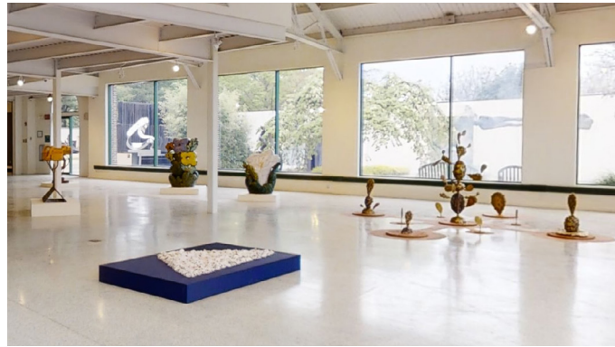
Virtual Tours are now available for both GFS Exhibitions