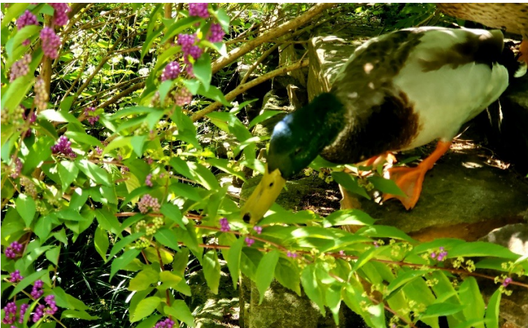
[ Ducks have emerged from the Rat's pond to enjoy some Callicarpa berries in October ]

Flanking the Pyracantha hedge is another thorny, fruiting hedge – but this time, it's citrus! Poncirus trifoliata 'Flying Dragon' is a deciduous shrub or small tree that is commonly known as Hardy Orange . This hardy citrus plant produces an abundance of small yellow citrus fruits in the fall. This particular cultivar, 'Flying Dragon,' is known for its twisting, contorted stems and intimidatingly large, curved thorns. The fruit is very seedy and highly acidic, so it should not be eaten raw. The fruit can be used to make marmalade but is often left on the plant (as is the case at GFS) for its ornamental value. Be sure to take a look at the Hardy Orange fruits in September!