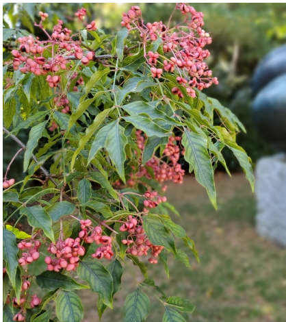
[ Euscaphis japonica covered in bright pink heart-shaped berries in October ]