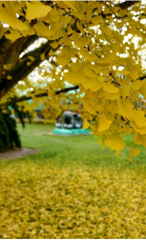
[ Ginkgo biloba in November, beginning to carpet the ground below with its brilliant golden yellow leaves ]