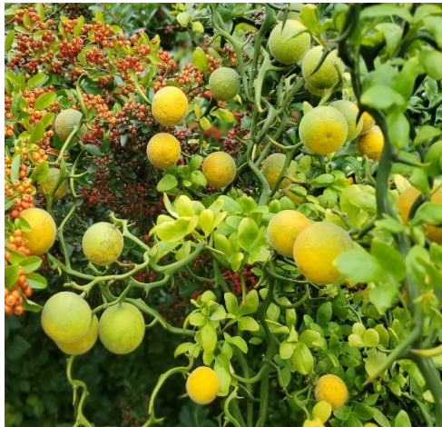
[ Poncirus trifoliata flanked by Pyracantha coccinea , is laden with ripening citrus fruit in September ]

Flanking the Pyracantha hedge is another thorny, fruiting hedge – but this time, it's citrus! Poncirus trifoliata 'Flying Dragon' is a deciduous shrub or small tree that is commonly known as Hardy Orange . This hardy citrus plant produces an abundance of small yellow citrus fruits in the fall. This particular cultivar, 'Flying Dragon,' is known for its twisting, contorted stems and intimidatingly large, curved thorns. The fruit is very seedy and highly acidic, so it should not be eaten raw. The fruit can be used to make marmalade but is often left on the plant (as is the case at GFS) for its ornamental value. Be sure to take a look at the Hardy Orange fruits in September!