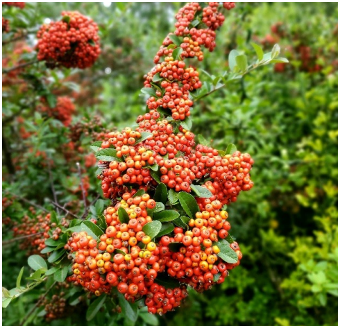
[ Pyracantha coccinea covered in large clusters of orange-red berries in September ]

Pyracantha coccinea is commonly known as Scarlet Firethorn , which refers to its thorny branches and orange-red berries. This evergreen shrub blooms with small white flowers in spring/summer, but its real time to shine is in the fall, when it is covered in clusters of brilliant red berries. You'll find a hedge of Scarlet Firethorn behind the SJCA, along the back of the northside parking lot – keep an eye out for the berries in September!