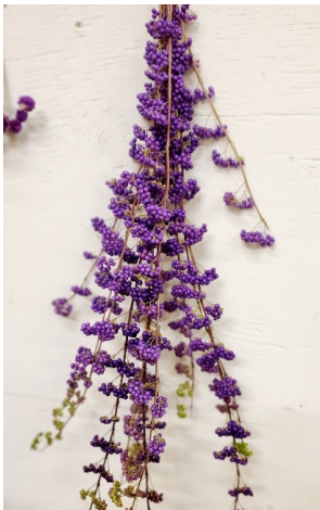
[ Callicarpa branches harvested for use in arrangements ]