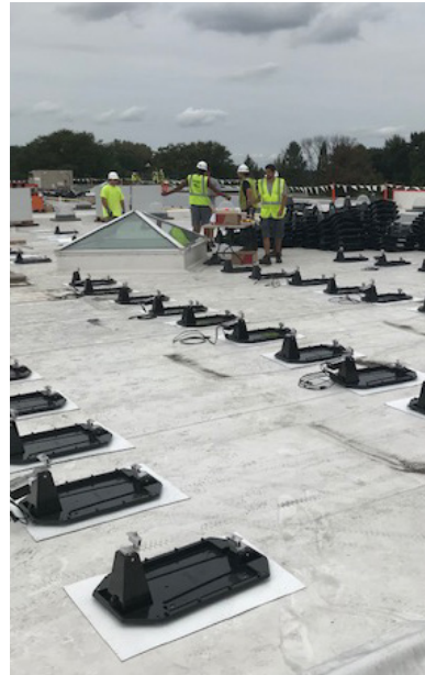
Geoscape Solar technicians hard at work installing the 1688 solar panels.

The partners were also impressed with GFS's commitment to use cutting edge technology in order to maximize both their solar production and carbon dioxide offset. Their 600-kW system covers over 90% of their electrical usage. This translates into 32,748,266 pounds of Carbon Dioxide being taken out of our atmosphere over the lifetime of their system.