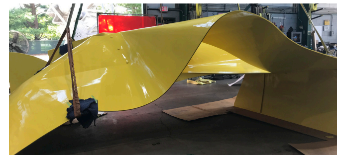
Work in progress at The Seward Johnson Atelier, repainted and newly reassembled.