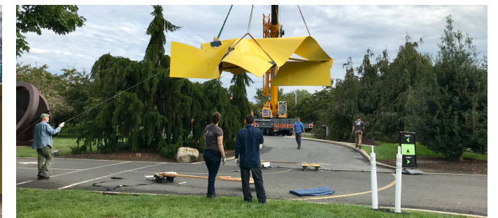
Reinstalling the restored sculpture with GFS staff, The Seward Johnson Atelier, and Thackray Crane.