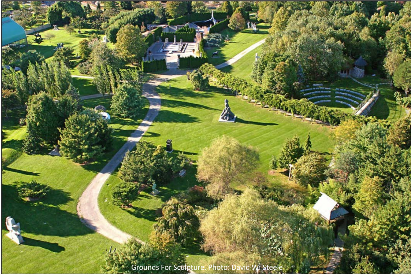
Grounds For Sculpture.

Grounds For Sculpture is a 42-acre sculpture garden, museum, and arboretum founded on the site of the former New Jersey State Fairgrounds.