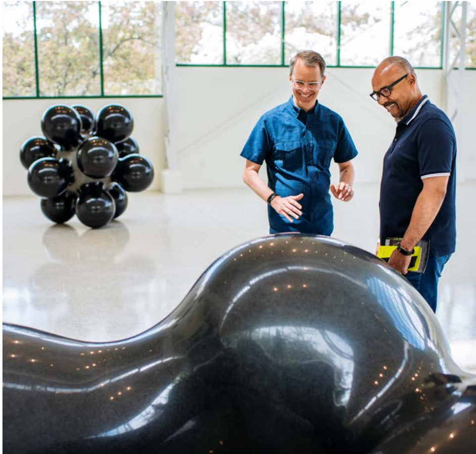
Masayuki Koorida, Black Light , 2015, granite, 62.99 x 71.65 x 64.36 inches, Collection of the Artist.

Artwork at Grounds For Sculpture is displayed in indoor galleries and throughout our garden.