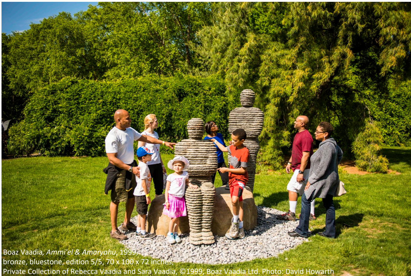
Boaz Vaadia, Ammi'el & Amaryahu , 1999 bronze, bluestone, edition 5/5, 70 x 100 x 72 inches, Private Collection of Rebecca Vaadia and Sara Vaadia, ©1999, Boaz Vaadia Ltd.

You are invited to touch select outdoor sculptures to learn about their surface and material. Remember that all sculptures are original artworks and should be touched gently.