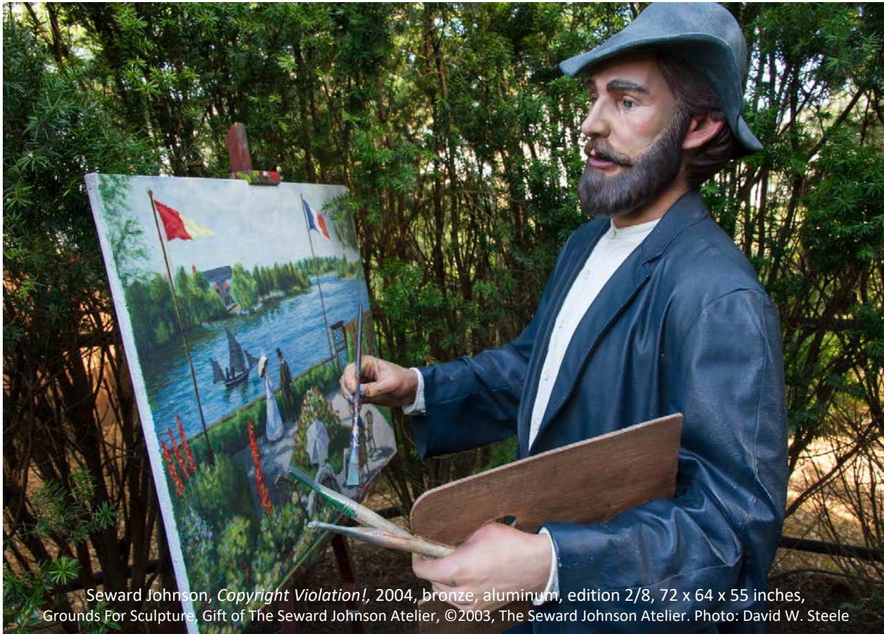
Seward Johnson, Copyright Violation! , 2004, bronze, aluminum, edition 2/8, 72 x 64 x 55 inches, Grounds For Sculpture, Gift of The Seward Johnson Atelier, ©2003, The Seward Johnson Atelier.

Sculptures created by Grounds For Sculpture's founder Seward Johnson can be found throughout the gardens. Seward Johnson was born in New Jersey and is famous worldwide for his life-size bronze figurative sculptures. In 2014 he was added to the New Jersey Hall of Fame.