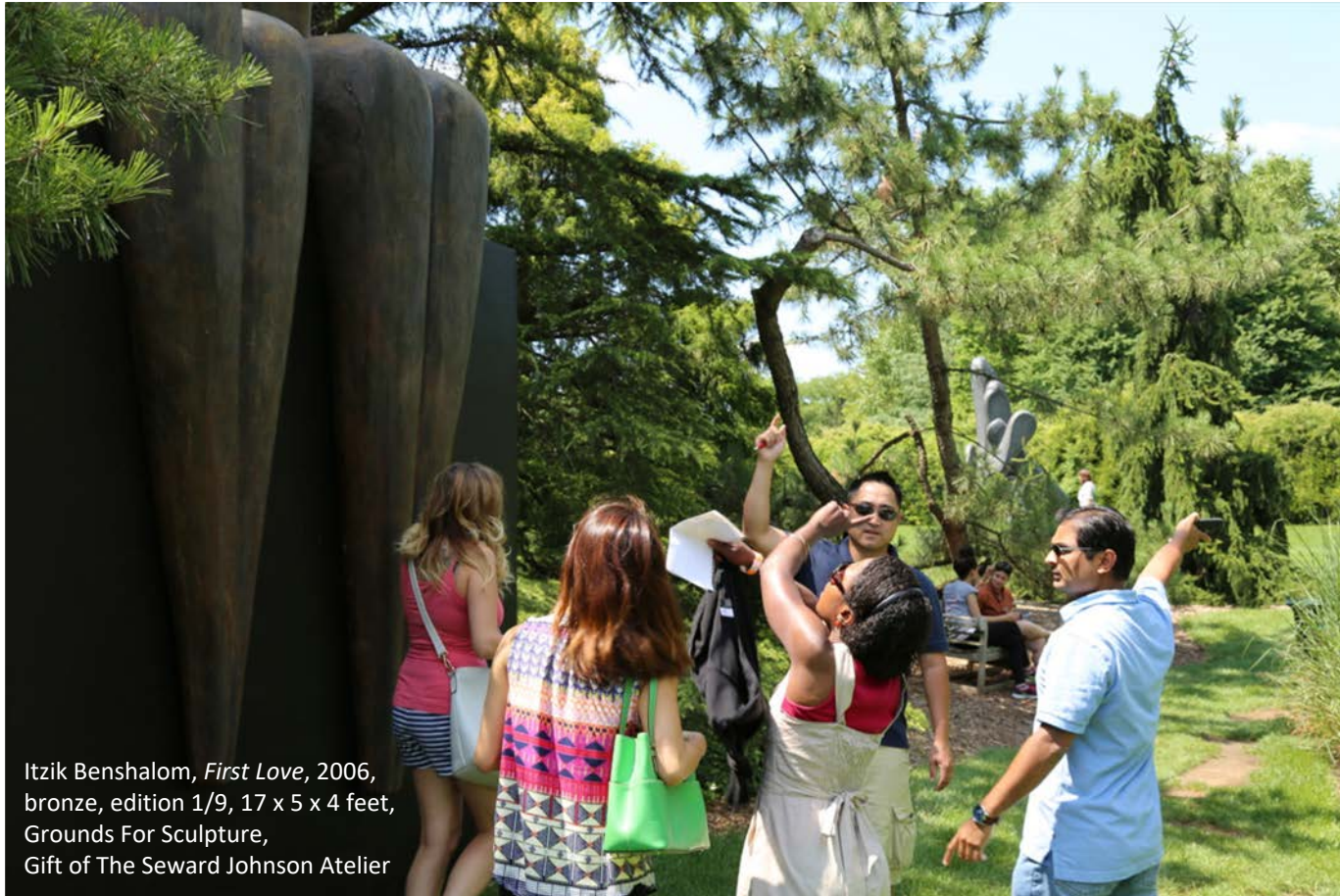
Itzik Benshalom, First Love , 2006, bronze, edition 1/9, 17 x 5 x 4 feet, Grounds For Sculpture, Gift of The Seward Johnson Atelier

There are different ways to experience Grounds For Sculpture. Your group may choose to self-guide with your teacher or family or to take a tour with one of our docents. A docent is a guide who shares information about the art on view.